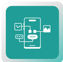
Merlin GenAI Applications (Apps)