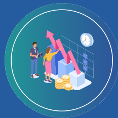
Task Force Committee (Combination of IT, Procurement, Risk, Finance and Treasury members)